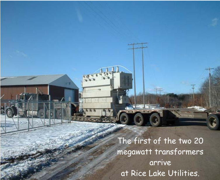
The first of the two 20 megawatt transformers arrive at Rice Lake Utilities.