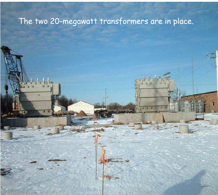
The two 20-megawatt transformers are in place.

In October Rice Lake Utilities held a groundbreaking ceremony for the new substation currently being built. The new substation will give Rice Lake Utilities additional capacity and will increase reliability. Phase I of the project, which included the concrete and ground grid portions for the new substation, has been completed. The second phase of the project will include construction of the steel structures and the remainder of the electrical apparatus. Phase II is scheduled to be completed in the 1 st quarter of 2004.