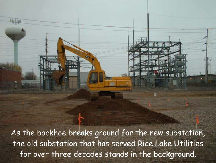
As the backhoe breaks ground for the new substation, the old substation that has served Rice Lake Utilities for over three decades stands in the background.