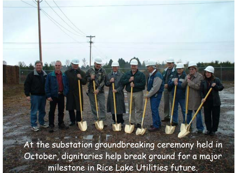
At the substation groundbreaking ceremony held in October, dignitaries help break ground for a major milestone in Rice Lake Utilities future.